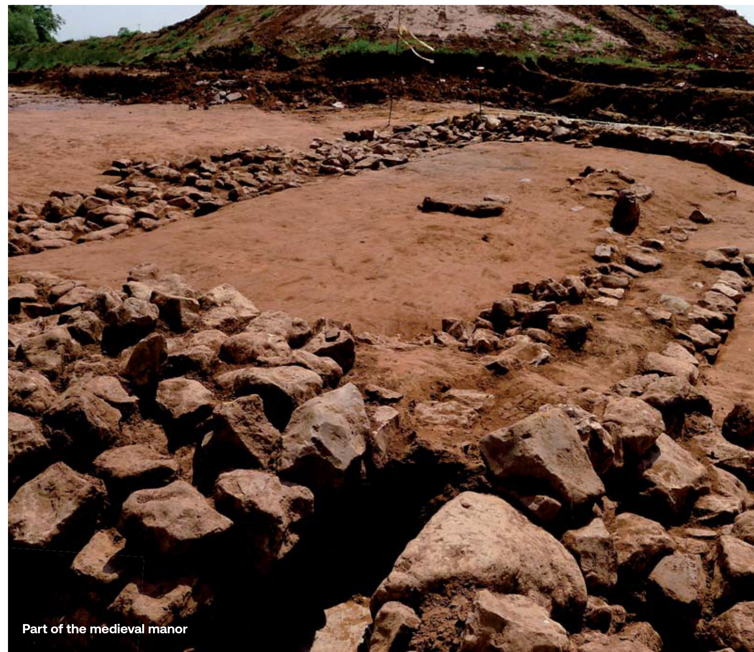
Part of the medieval manor

This discovery generated an exceptional level of local interest, and a series of public engagement events were held, including a community open day and visits attended by local schools and all interested local history societies, which resulted in significant positive press coverage for both the housebuilders and the archaeological contractor.